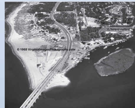
Fish House Island 1968

We are excited to have scientists from Virginia Institute of Marine Science and Old Dominion University, representatives of several state agencies including Virginia Marine Resources Commission and the Virginia Department of Game and Inland Fisheries, the US Army Corps of Engineers, the City of Virginia Beach, marine engineers, and the leading wetlands experts in Hampton Roads represented on this Task Force. The work ahead of us is not going to be easy, but could have long term benefits for the Lynnhaven River and for other tributaries throughout the Chesapeake Bay.