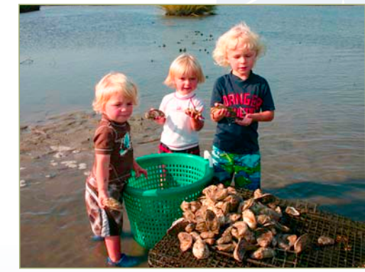
The three Ludford boys