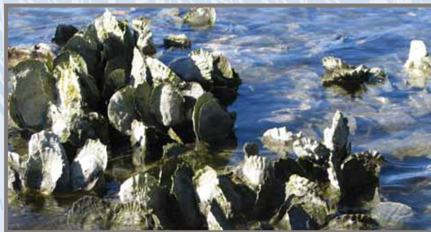
OYSTERS IN PLEASURE HOUSE CREEK BY CHRISTOPHER NELSON